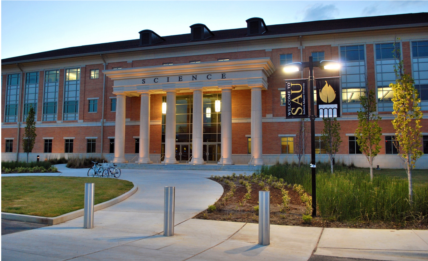
Southern Arkansas University