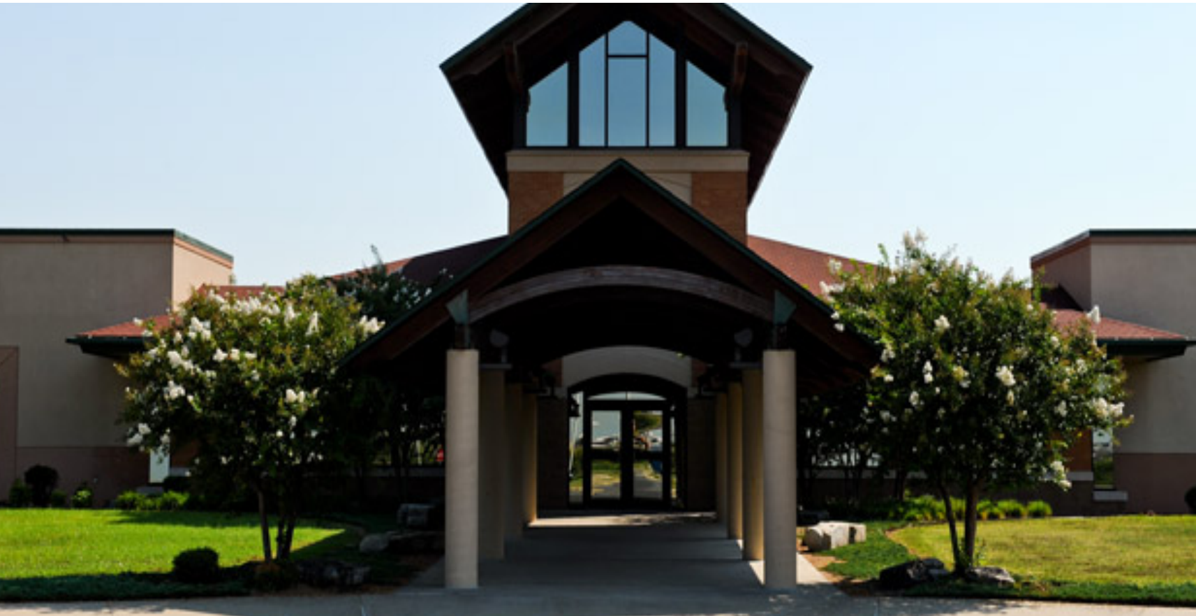
Phillips Community College